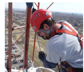
Wisper technicians installing a PTP radio on a tower.